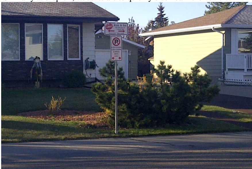
Typical sign placement on the street designating a Kiss & Go zone.

The signs are placed at each end of the Kiss and Go Zones. It states the 2 minute time limit between 8:30am to 9:30am and 2:30pm to 3:30pm.