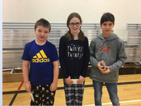
Athletes of the Month