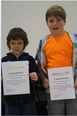
Fresh Fruit Friday Winners