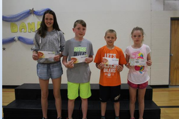
Grizzly Athlete of the Month Winners

Thank you to all of our business sponsors for providing prizes for our winners this year.